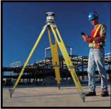
done using GPS.

For larger projects, surveyors are increasingly using the Global Positioning System (GPS) , a satellite system that precisely locates points on the earth by using radio signals transmitted via satellites . To use this system, a surveyor places a satellite signal receiver, a small instrument mounted on a tripod, on a desired point. The receiver simultaneously collects information from several satellites to establish a precise position. Surveyors then interpret and check the results produced by the new technology. The receiver also can be placed in a vehicle for tracing out road systems. Because receivers now come in different sizes and shapes and the cost of the receivers has fallen, much more surveying work is being